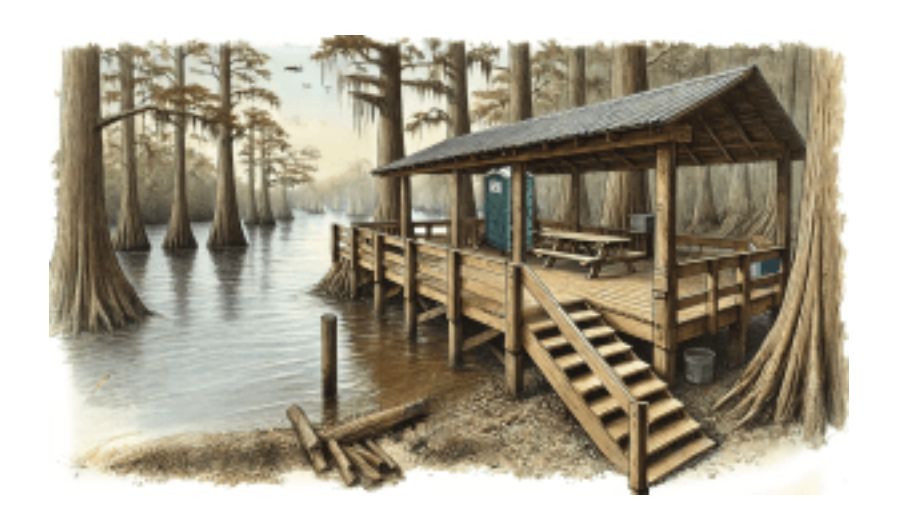
Wilderness Camping Platform

As they paddled towards the platform, a collective sigh of relief escaped their lips. "And a functioning porta-potty!" Riley exclaimed, her voice filled with mock theatrics. "Civilization at last!" They'd all silently harbored similar desperate longings for the past few hours, and Riley's outburst brought forth a chorus of laughter.