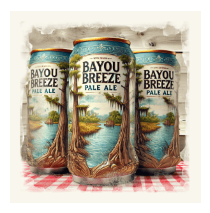
Bayou Breeze Pale Ale

"You got it." Wally then proceeded to fill five frosted pints with Bayou Breeze Pale Ale , a hazy orange brew, a full-bodied, crisp beer, pleasant to the mouth and refreshing. "Whoa, now that's what I'm talkin' about!" Everett exclaimed. The sentiment echoed among them as they all agreed, raising their glasses in a toast to their mission, their friendship, and to Tom Rivers. With each swallow of Bayou Breeze, they quenched their thirsts and celebrated this moment.