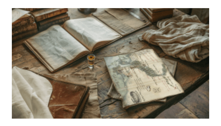
Drying the waterlogged manuscripts

"Wow," he breathed, leaning forward. "That's... incredible. It sounds like you stumbled onto something quite interesting!"