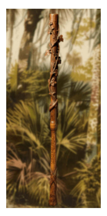
The Sacred Staff

The whispers of his ancestors grew louder, their voices blending with the rustle of the leaves above, urging him on. He dug with purpose, driven by a certainty that whatever lay beneath was not meant to stay hidden.