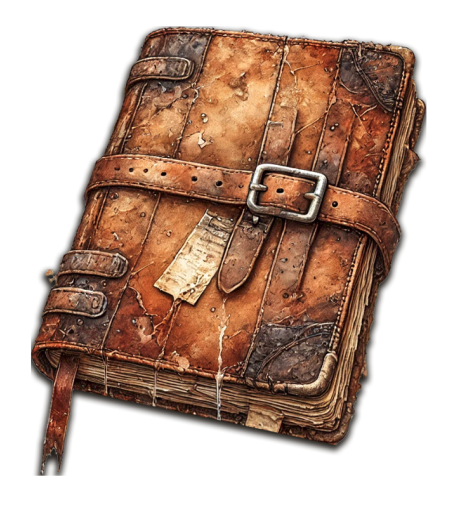
Tom River's Journal

"Something...interesting?" Everett raised an eyebrow, intrigued.