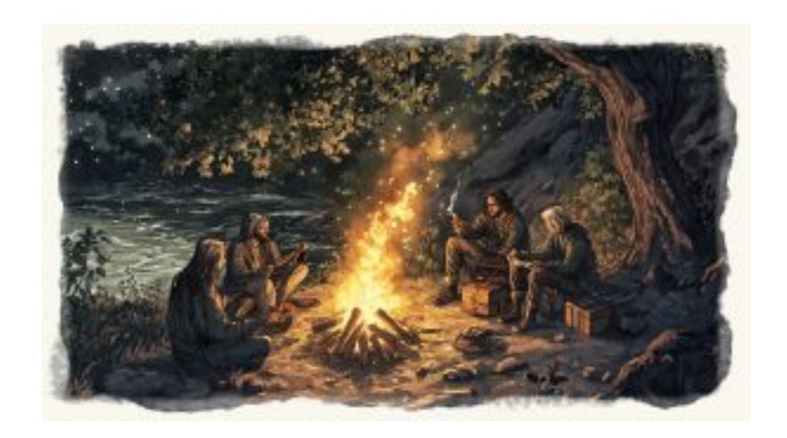
Around the Fire

The crew, listening intently, could hear the distant rush of water, a constant reminder of the impending trial that awaited them at first light.