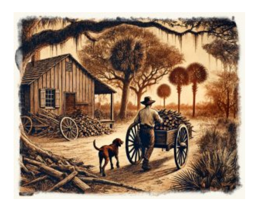
Everett collects more Firewood

"Sounds like a good plan, Ev. Don't stay up too late!" Sarah gave him a kiss and retreated upstairs.