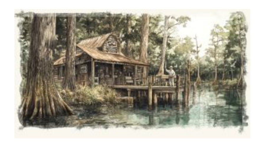
Approaching Whitey's Fish Camp

The crew gathered around the makeshift dining area, exchanging thoughts about the journey ahead. Everett unfolded the map to discuss the day's plan.