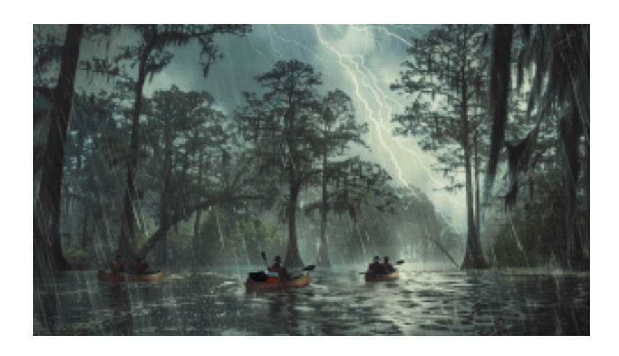
Storm on the River

Two miles downstream, the heavens unleashed their fury. Lightning forked through the clouds followed by deafening crashes of thunder in a non-stop progression of the storms fury. Rain descended in sheets, obscuring their surroundings. Frog Tog ponchos and wind jackets provided some defense, but the cold October rain seeped through, chilling them to the bone.