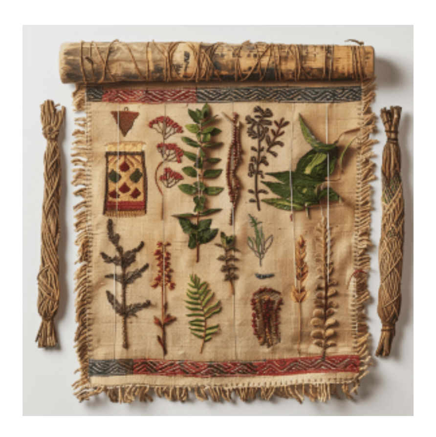
Timucua Herbal Tapestry

Near the top, an opening revealed a hollow interior, designed to house a collection of Timucua healing herbs. The handle was wrapped in supple leather, worn but still retaining its natural beauty. Along with the herbs was a delicate yet resilient fabric, woven from plant fibers native to the Timucua region. They carefully unfurled it, revealing a compact, detailed tapestry designed to fit snugly within the secret compartment near the top of the staff.