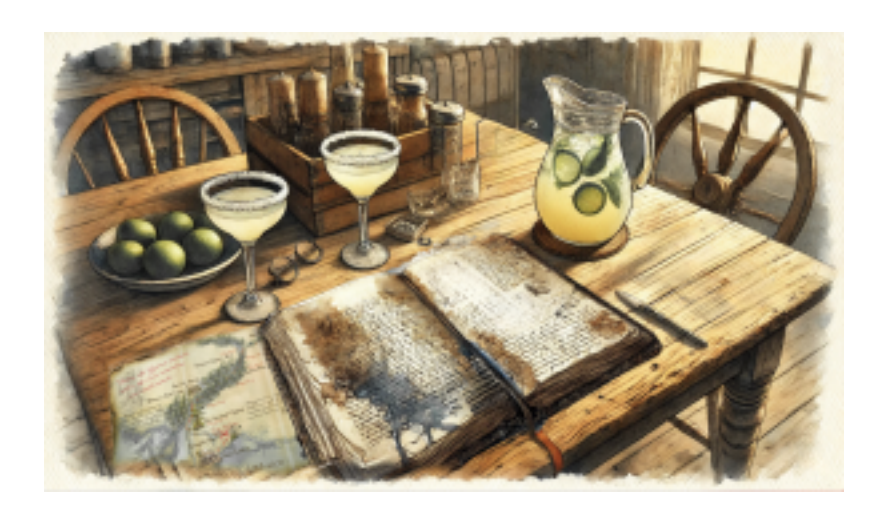
Dried and Ready to Explore

The afternoon sun cast warm rays on the kitchen table, and Sarah and Everett hovered over the dried journal. The air crackled with anticipation as they finally declared it safe to examine. After a lite lunch, two shots of tequila now replaced the Chamomile tea. Sarah and Everett were ready. They toasted, smiled at each other and carefully opened page one of the journal.