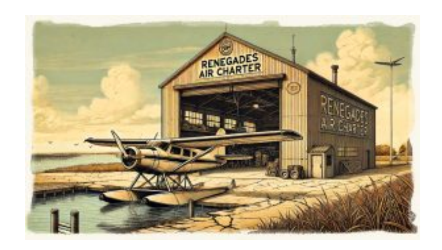
Renegades Air Charter

"Folks, you've traveled a long way to this hidden haven. But how do you plan to get back from the middle of nowhere?"