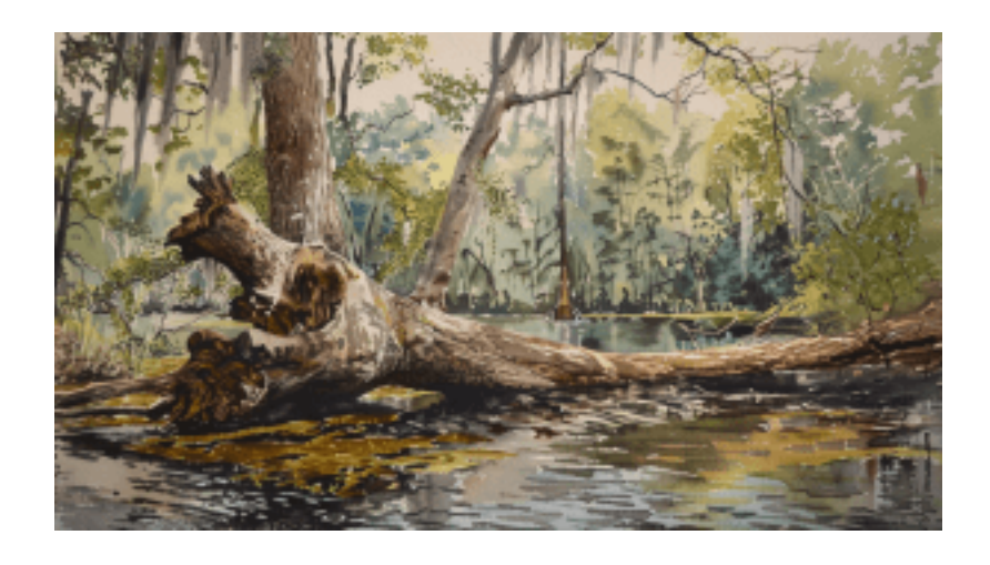
Downfall on Buttonbush Creek

The crew navigated through the narrow confines of the creek, with overhanging branches and buttonbush clumps creating a serene canopy above them. The air was filled with the subtle fragrance of the wetlands, and the sound of paddles slicing through the water merged with the rustling of leaves.