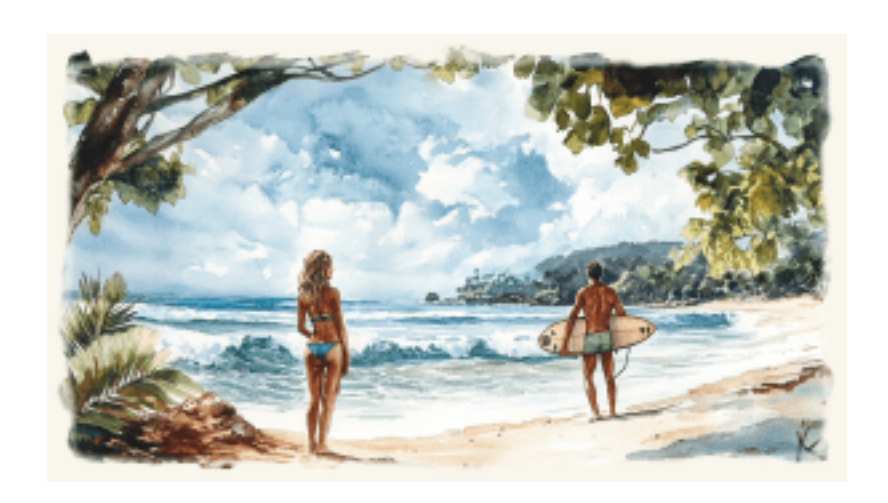
A Bad Memory

"Last year, while we were in Costa Rica, she met a young surfer. I had to run into the nearby town for errands, she headed down to the beach. She watched this man skillfully glide with the waves and when he eventually came ashore, he introduced himself.