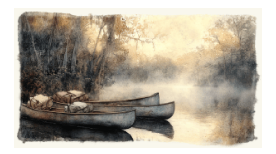
Ready to Go!

"Let's do this!" Everett called out, his voice a blend of excitement and determination. They all high-fived, boarded their canoes, and pushed off into the foggy Buttonbush Creek. The journey into Renegade Bayou awaited, and with the chill of the October morning air on their faces, they set forth into the misty waters. The first strokes of their paddles marked the beginning of an extraordinary adventure.